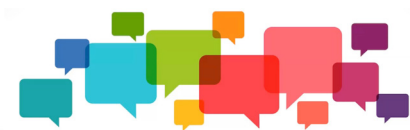
Impactful Coaching Webinar Series

For the last six years, AWSA has been able to provide opportunities for school and district leaders and classroom coaches of all kinds, to learn and grow their coaching capacity. Our Impactful Coaching Academy has been very popular each year and has served many Wisconsin educators. Also offered is Impactful Coaching: Advancing Your Skills, which is a two-day Academy meant for any educator who has already participated in the four-day Academy but is seeking ways to further practice and grow.